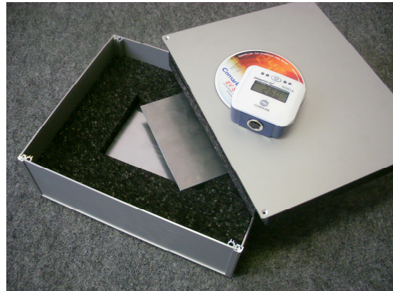
3-layer calorimeter with data logger system