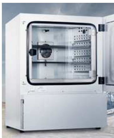
Climatic exposure test cabinet (not included in the delivery)